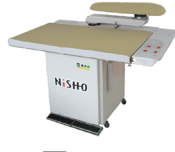
MODEL NH-1265BK With Buck