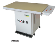
MODEL NH-1390K without Buck