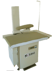
MODEL NH-1265GNST with Built-in Steam Generator

* Specification and design are subject to change without prior notice.