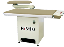
MODEL NH-1265BJ / NH-1580BJ