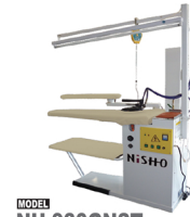
MODEL NH-930GNST U Shaped Table with Built-in Steam Generator (Exclude Iron)

* Specification and design are subject to change without prior notice.