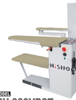
MODEL NH-930VBST U Shaped Vacuum & Blowing Ironing Table