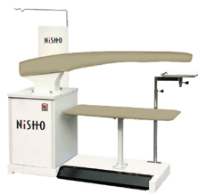
MODEL NH-920 Seam Opening Table

* Specification and design are subject to change without prior notice.