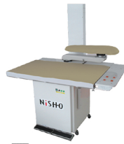
MODEL NH-1265VBST Vacuum & Blowing Ironing Table