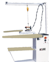
MODEL NH-930ST U Shaped Table (Exclude Iron)