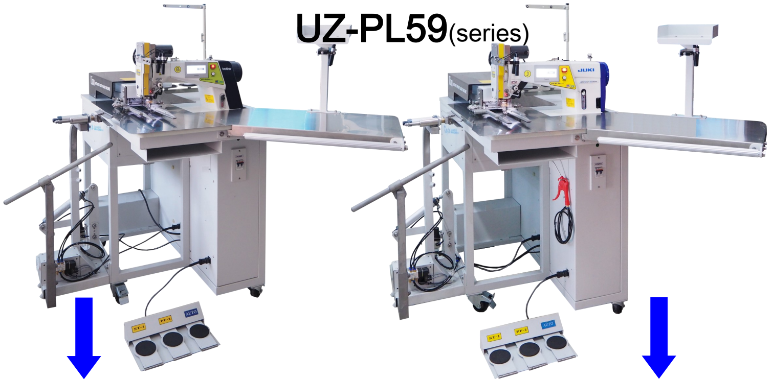
UZ-PL59-B (brother head)